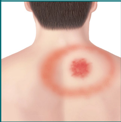
Bull's eye rash on the back.