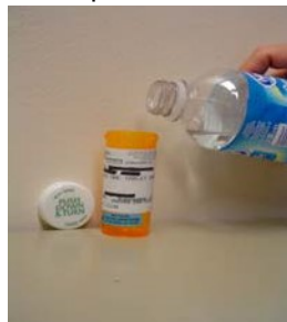
Mix with water and coffee grinds, cat litter, or dirt